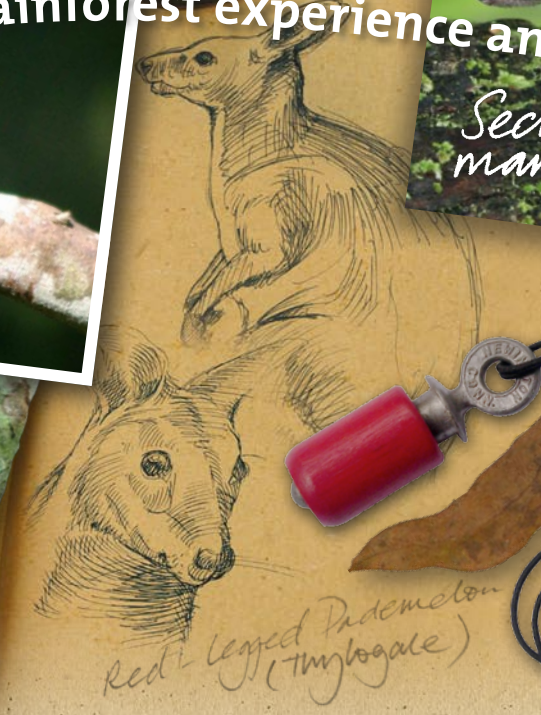
Red-legged Pademelon (Thylogale)