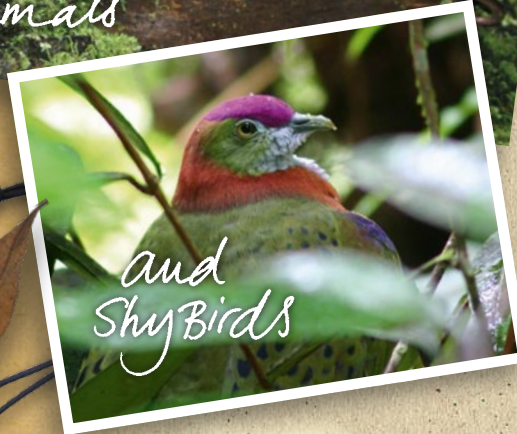
and Shy Birds