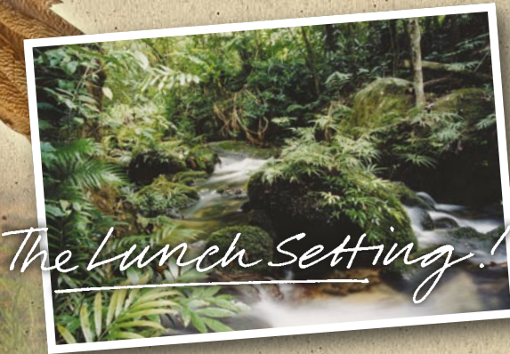
The Lunch Setting!